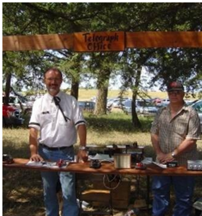
The Telegraph Office

See: http://www.arrlmidwest.org/ponyexpress.html