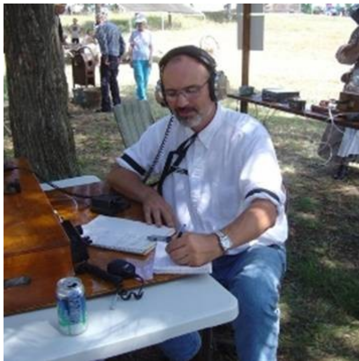
Taking a message